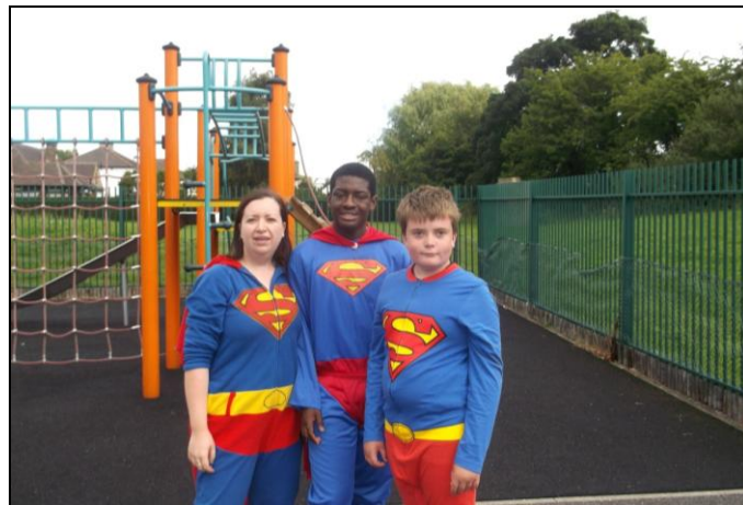
The Supermen Triplets!

On the last day of the scheme we all come in fancy dress, and have a party lunch and disco, everyone made such a great effort in their costumes, some of them even went out on a trip in the morning dressed up. Some of the children really enjoy doing Karaoke and they all like dancing with their new friends, parents and siblings can also attend and some do, so they can see us in action which they find reassuring to know where their child has been spending time and having fun.