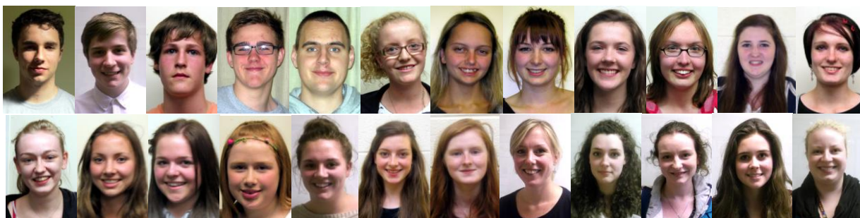
Some of our Fantastic Volunteers