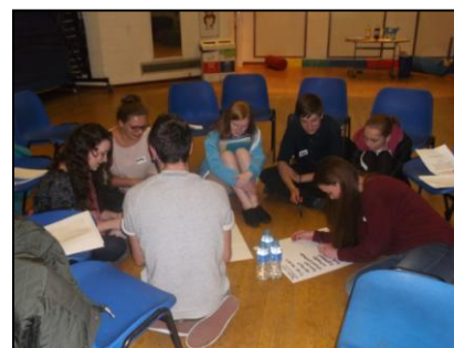
Course participants hard at work

In July, ahead of the Summer scheme, ASAS worked with Omega Training Services to deliver a bespoke programme of training open to all leaders and volunteers working on the scheme. The training sought to develop teamwork and confidence in working with the wide-range of children who attend the scheme but also delivered specific sessions aimed at developing new skills and equipping people with the important knowledge and competencies needed during the scheme.