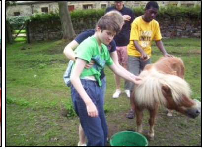
Visit to Sensory Leeds, Play area and Lineham Farm