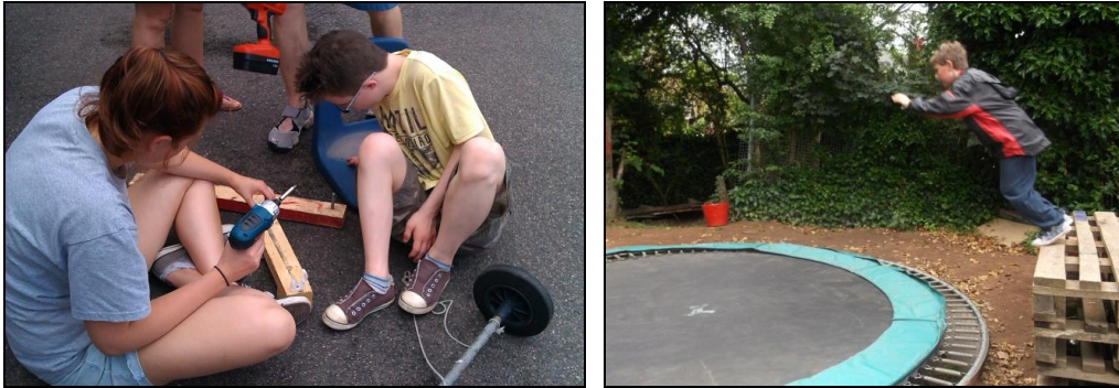
Go-kart building and visit to The Big Swing Adventure playground

The 9-12's group were a more of a laid back group, there were several children with physical disabilities in this group but they were able to integrate and enjoy most of the same activities as their able bodied peers, and when they couldn't alternative activities were always planned such as rebound therapy, hydro therapy, sensory sessions and aromatherapy. The group enjoyed the in centre activities like Morley Exotic Animals, Billy Biscuit and Nick Toczec – children's entertainers, wood work, Go-kart and den building sessions, and trip out to Lineham Farm for climbing and animal care sessions; Leeds Wall, Swimming and inflatables at Aireborough leisure centre, the Big Swing Adventure playground at Eccleshill; Nell Bank – obstacle course, pond dipping and water play and Eureka.