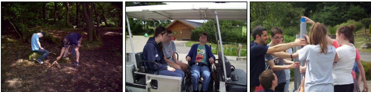
Activities at Nell Bank, Ilkley

The 13+ group comprises of a wider age and abilities range, they integrated some of the activities and trips with the 9-12's group so everyone was catered for. We have a lot of mainstream young volunteers in this group who are good role models and encourage the young people to behave appropriately, the group often go out by public transport – trains and buses, to gain independence skills and do things their non-disabled peers enjoy such as bowling, cinema, chilling in a café, reading magazines, listening to music. They enjoyed in centre activities like art, drama, trampolining and dance sessions, they also went to Nell Bank (below), Lineham Farm and swimming at Aireborough.