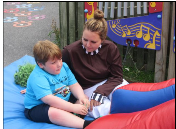
Riding at the Donkey Sanctuary and going on the bouncy castle with an Umpa lumpa!