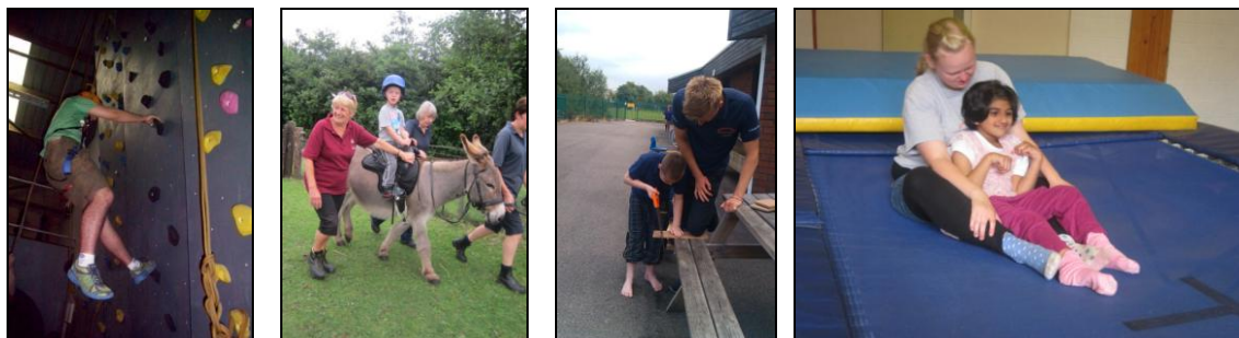
Leeds Climbing wall, Donkey Sanctuary, Woodwork session and Rebound therapy.